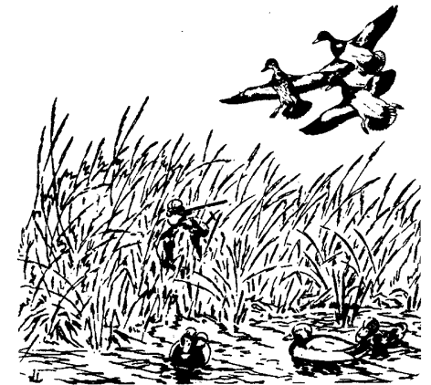
A cooperative public small game hunting area

Regulations Summary and Area Map July 1, 2011 - June 30, 2012