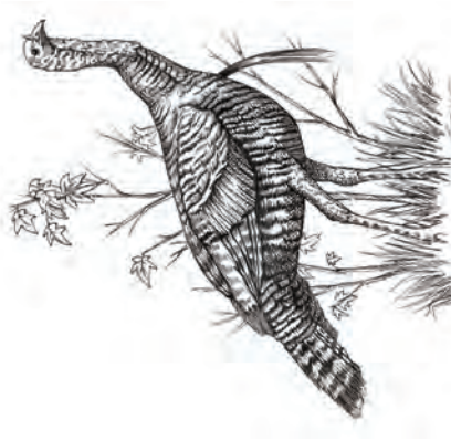
A public wildlife and recreational area

Regulations Summary and Area Map July 1, 2011 - June 30, 2012